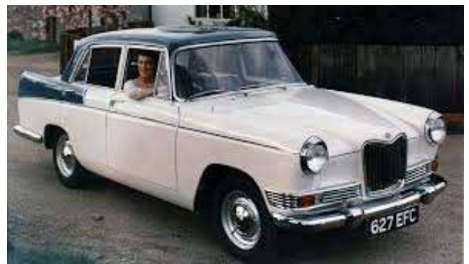
Large photo - Riley. Four smaller photos (clockwise) - Austin Cambridge, MG Magnette, Wolseley, Morris Oxford.